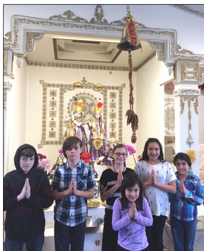
Neighboring Faiths students visit a Hindu temple